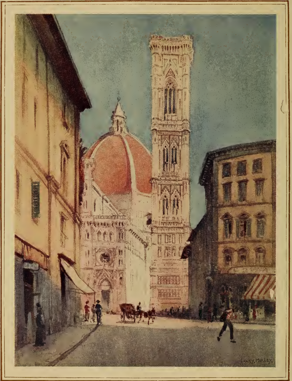
THE DUOMO AND COMPANILE FROM THE VIA PECORI